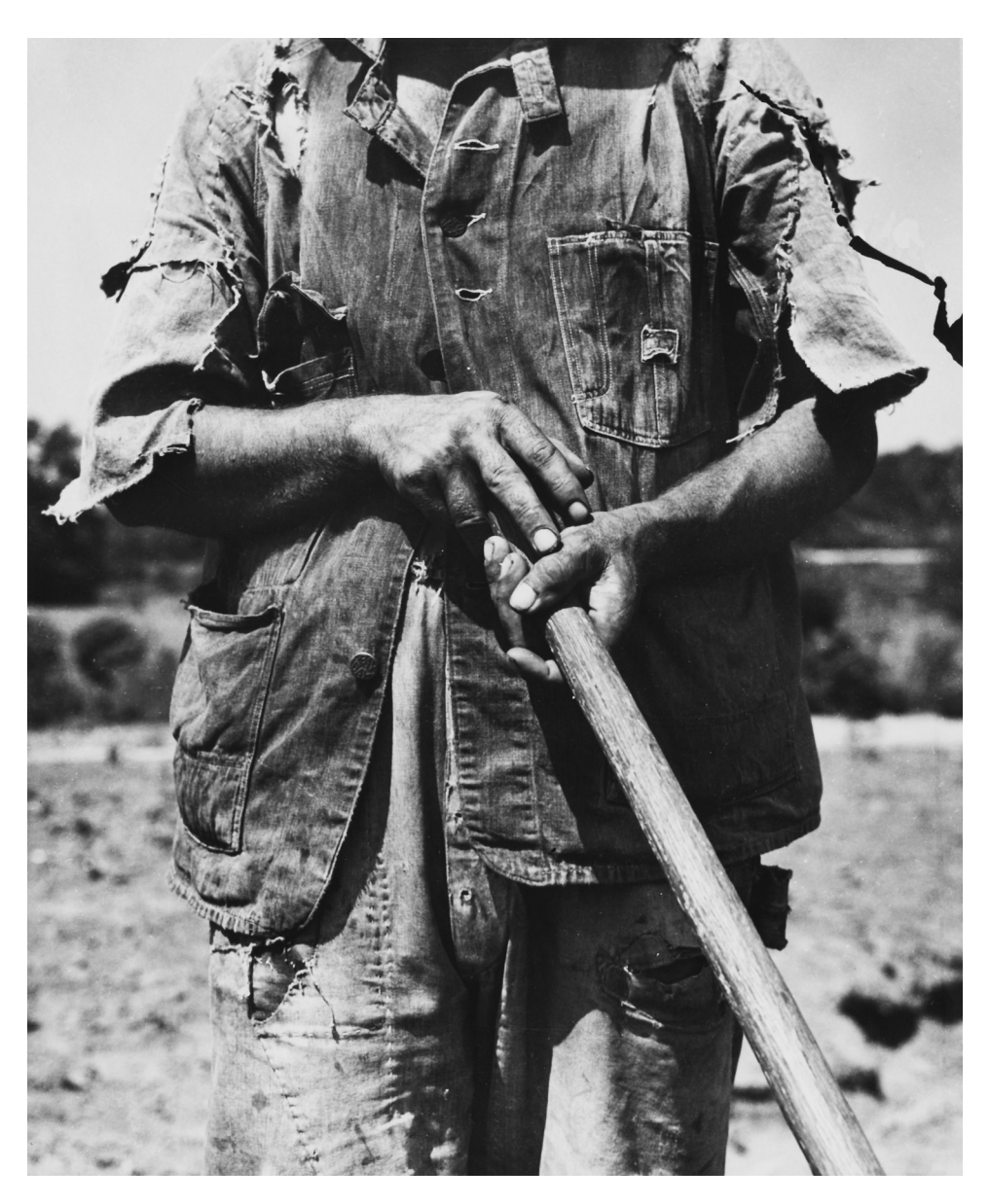
Dorothea Lange, Library of Congress, F34-9328 MB