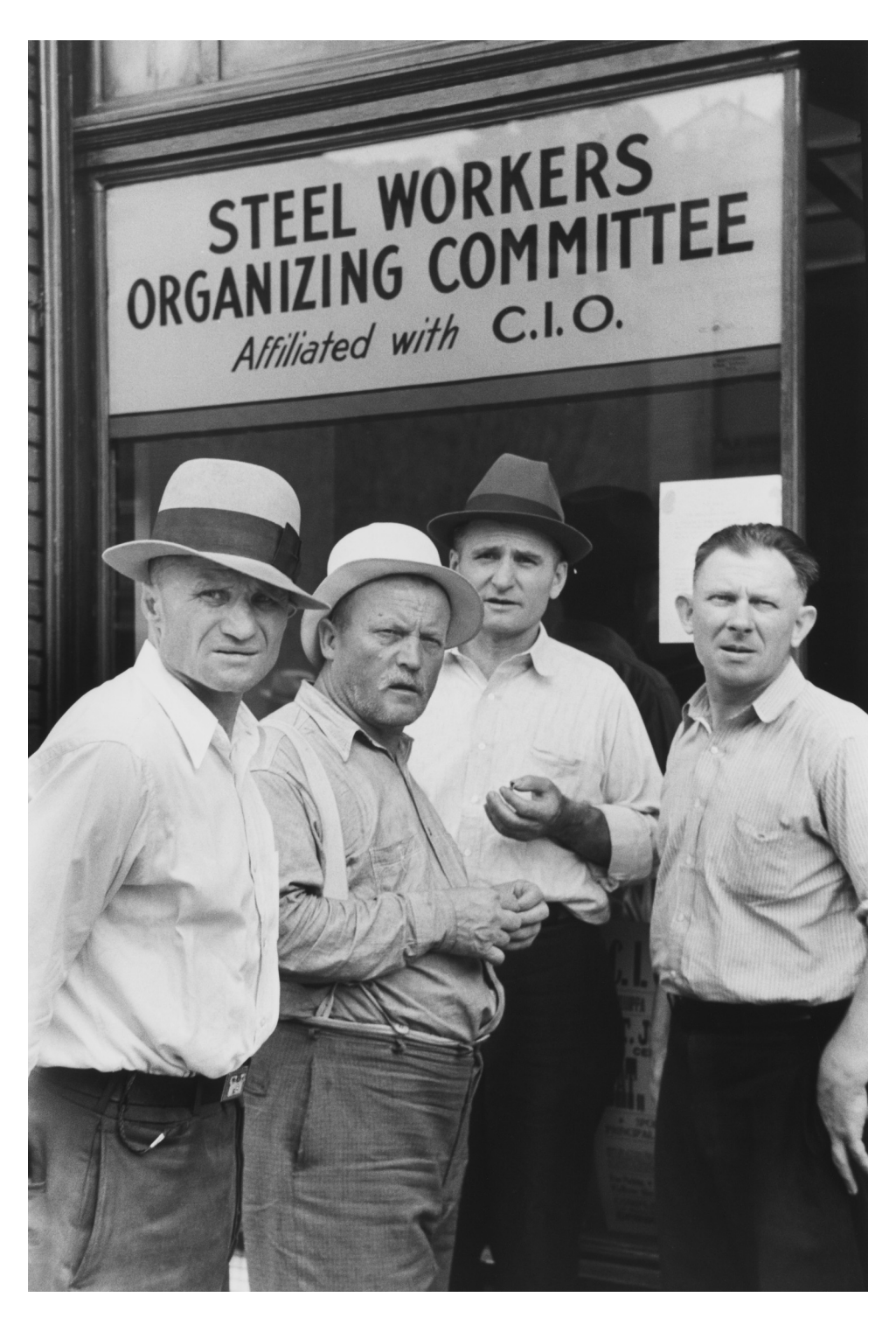
Arthur Rothstein, SWOC, Aliquippa, Pa. 1938, Library of Congress, LCUSF 33 02837